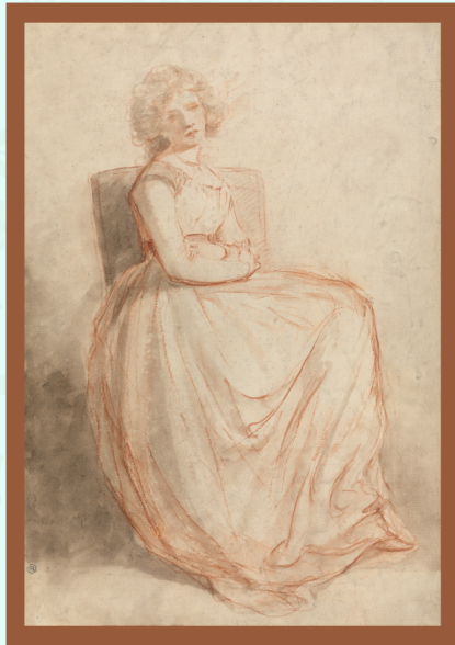
John Hoppner (1758-1810) Study of a Seated Woman, undated red chalk and gray wash Prints and Drawings Collection, B1977.6039

Image to the right: from The Picture Gallery ; or Peter Prim's Portraits of Good and Bad Girls and Boys (1814)